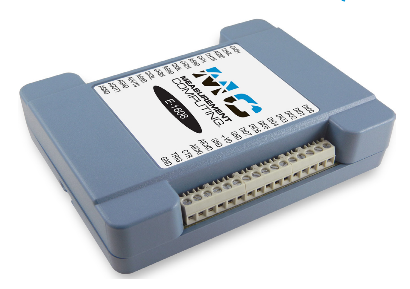
The E-1608 offers high-speed analog input over an Ethernet inetrface, two analog outputs, eight digital I/O, and one event counter input.